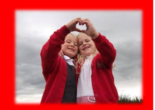
Inspiring – Nurturing – Achieving

It's been a busy but great couple of weeks.